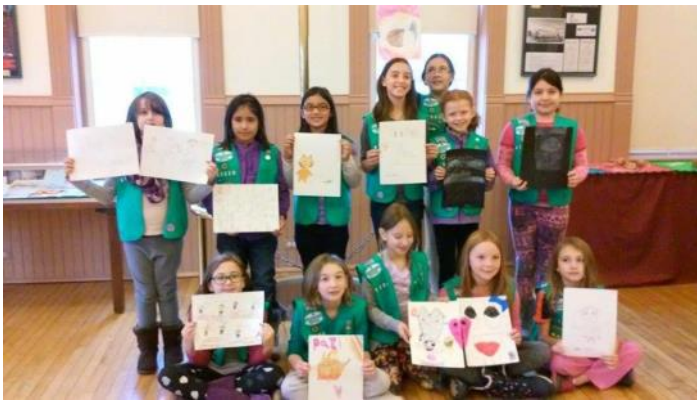
Juniors' Drawing Workshop—2015

Complete badge requirements in a single day at the Skokie Heritage Museum. Small troop? Invite another to join you. Each workshop lasts 2 hours. Workshops fulfill the following badges: Juniors' Playing the Past, Juniors' Drawing and Brownies' Painting. Please contact the Museum for details or to register.