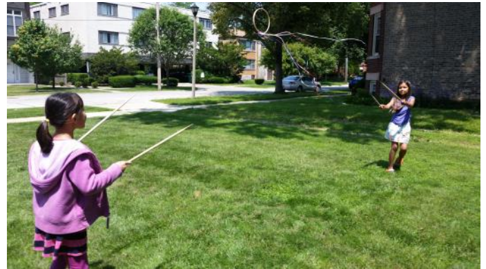
Colonial week—Summer 2015

Explore world history with arts and crafts projects and games from different time periods. Each week two new eras will be introduced. Sign-up for all five weeks or just the ones that interest your camper. We'll start in Ancient Egypt making frequent stops including in Ancient Greece, the Middle Ages, Colonial era, Victorian era and ending in the 1920s. For ages: 7-11 (Must turn 7 by 9/1/2016). For more information check out the Skokie Park District Summer Camp Brochure, visit www.skokieparks.org .