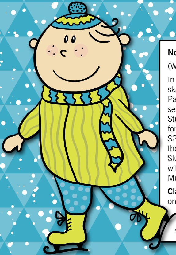
Figure Skating November 30 - February 20 10 weeks