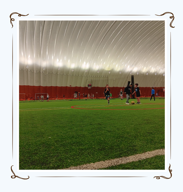
The Quad Dome