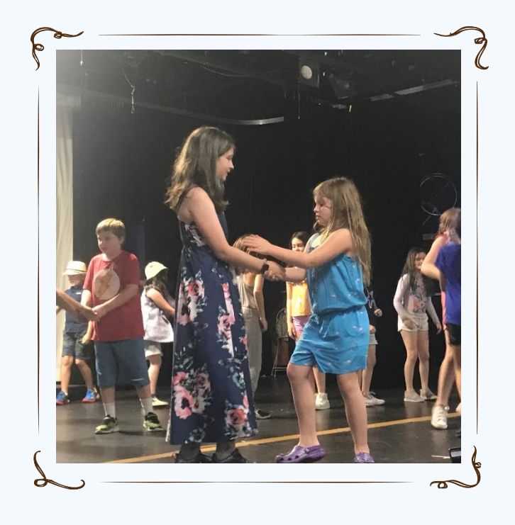
Everyone learns the camp dance!