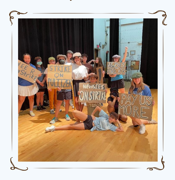
Teen Actors in Character