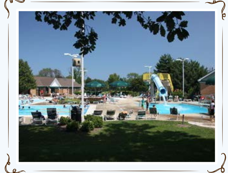
Little Travelers Photos