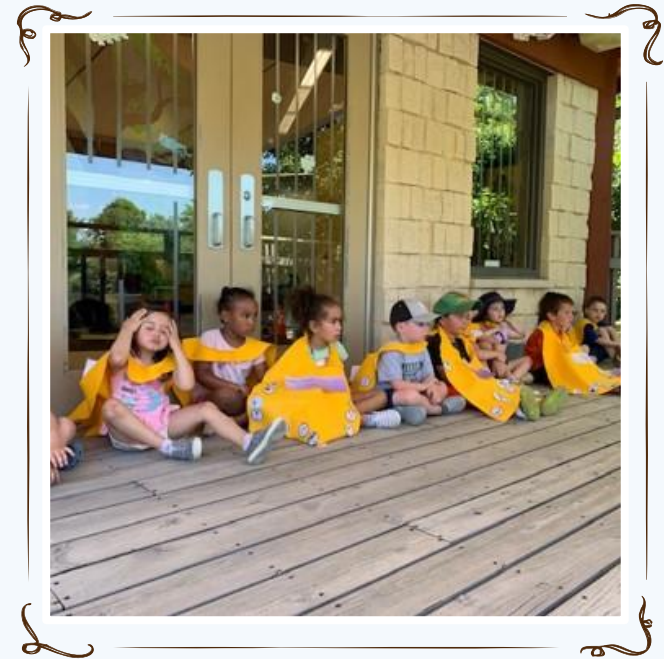
Badges & Superhero Capes