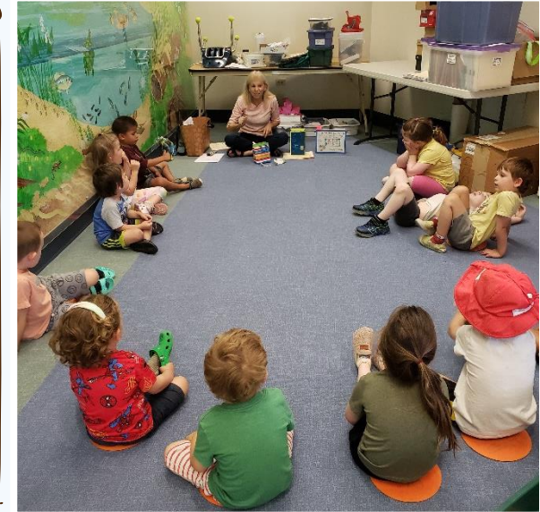
Sign Language Presentation