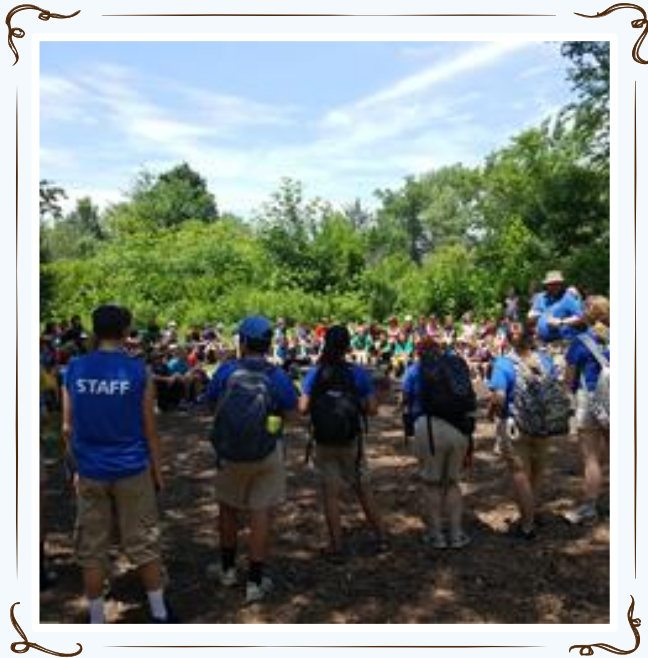
Activities With Earth Adventures Camps