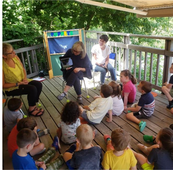
University Of Illinois Extension Presentation