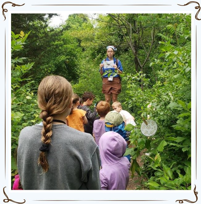
Leader Guided Activities