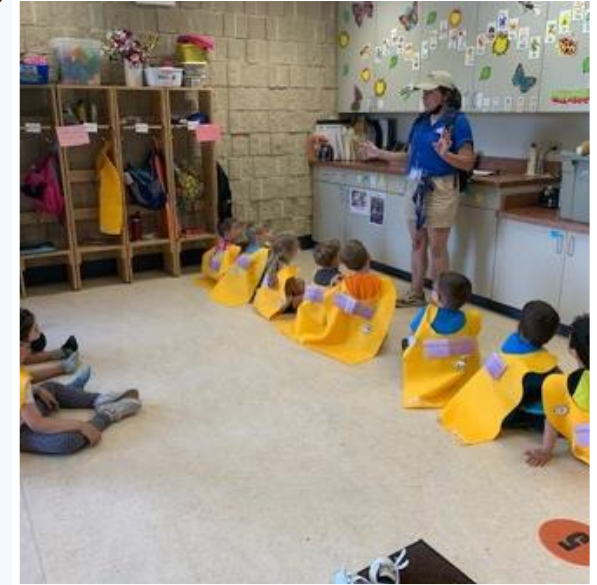
Badges & Superhero Capes