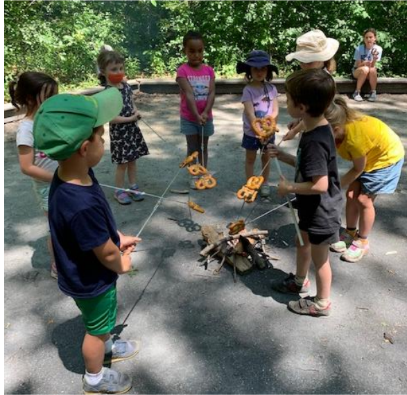
Cooking Over A Campfire