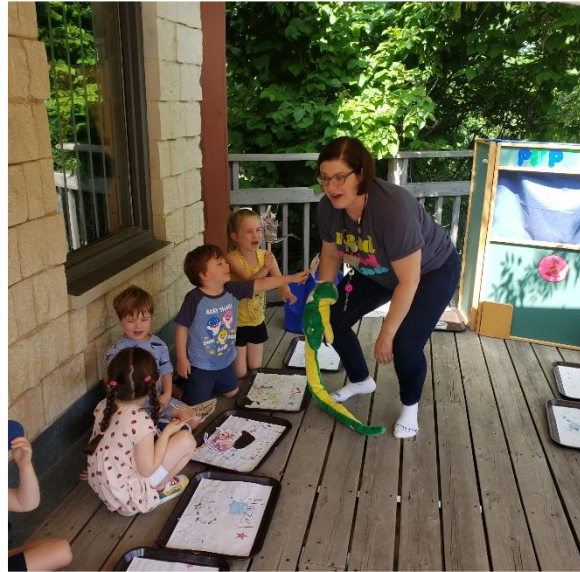
Skokie Public Library Presentation