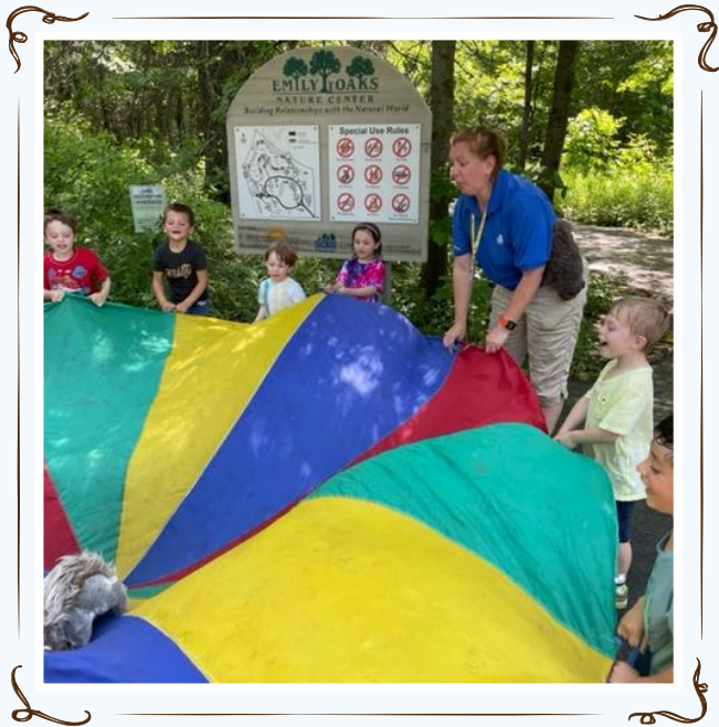
Leader Guided Activities