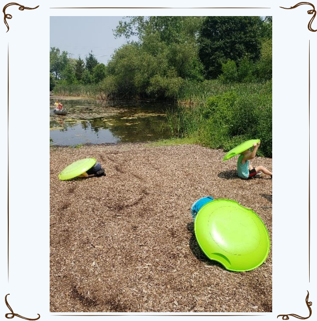
Imaginative Role Playing