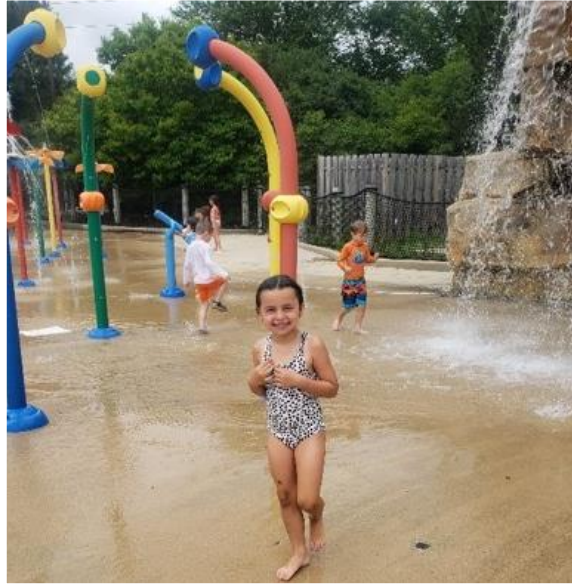
Oakton Splash Pad