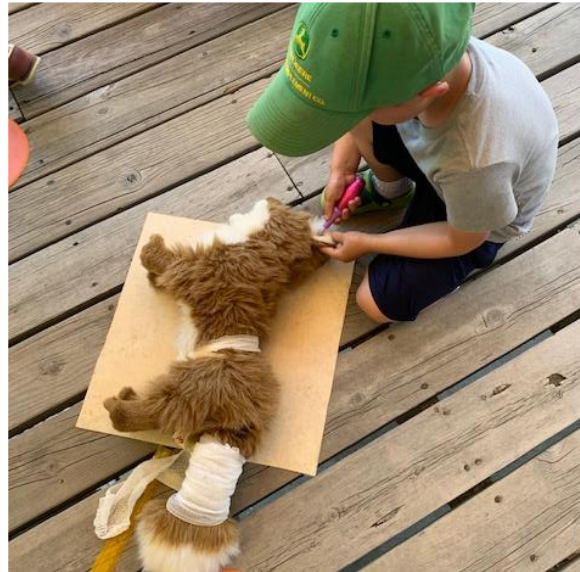
Imaginative Role Playing