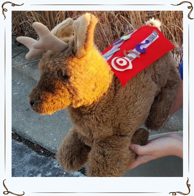
Meet A Plant Or Animal With Superhero Powers