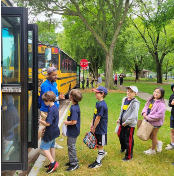
Getting ready for a field trip. Counselors follow safety procedures as we load the bus.