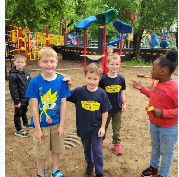
Playground fun- daily!

Please type questions in the chat for us to answer during presentation!