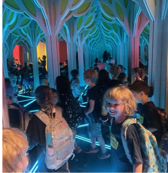
Mirror maze on our field trip to Museum of Science and Industry.