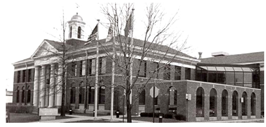
Village Hall, 1985

Names of other important figures and information about the Village Hall can be seen on bronze tablets near the front doors.