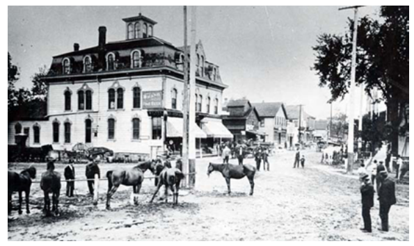
Market Day in Niles Center, looking north on Lincoln Ave. from Oakton St.

The destruction of property was not the only ill effect of the fire. In order to save their possessions many property owners placed their items outside on the street. Since, the fire occurred on market day and hundreds of strangers were in town, looting began. An emergency police force was deputized, which made 8 arrests. However, the fire did have its benefits for the need of a centralized water supply was recognized and the wooden structures destroyed