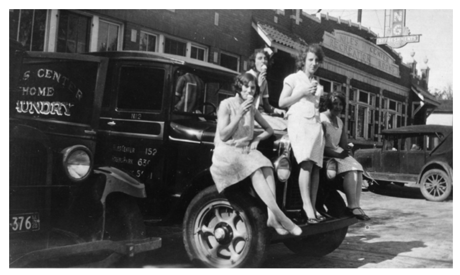
Girls eating ice cream in front of the Niles Center Recreation Rooms and Niles Center Home Laundry, c. 1920s

Remke's Shoe Store: 5110-5114 Brown St. Backtracking to the intersection of Brown St. and Floral Ave., and going east on Brown St., one will come across, what use to be Remke's Shoe Store. The building was originally located at the corner of Lincoln Ave. and Brown St., but then moved to its present location in the 1920s. The large store, made of a wood frame, was probably erected before 1900. Its age can be noted by observing its chimneys and wooden structure.