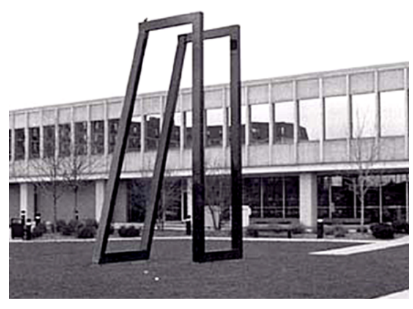
Mooney Sculpture, c. 1978

Until a separate police station opened in 1957, the village police department and jail were located in the hall; the east side windows were barred suggesting these were the jail cells.