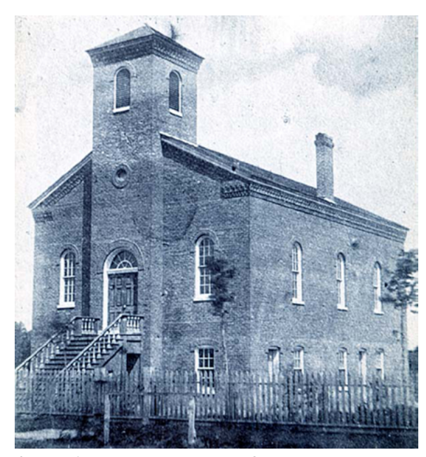
St. Peter's Evangelical Lutheran Church, late 1860s

which were added in 1887, were struck by lightening in 1901. This damaged the original church to the point that it needed to be rebuilt, which occurred in 1903. It was rebuilt with a design similar to the original, and certain items were re-used, such as bricks, doorknobs and other hardware. This church was home to many