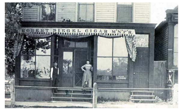
Siegel's Cigar Store, c. 1900s.

by the fire were replaced by fire resistant brick buildings. One business whose original wooden structure was replaced with a brick building was Siegel's Cigar Store and Barber Shop. This structure is located south of the current parking lot on the west side of Lincoln Ave.