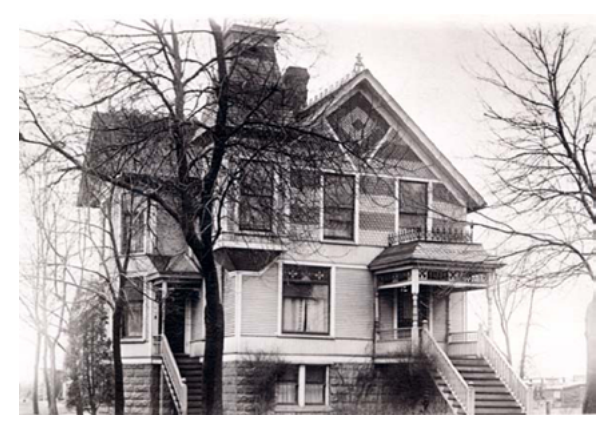
Home of Charles Kindt

The Kindt House: 8024 Floral Ave. This house across from the Skokie Heritage Museum was built in 1877. It belonged to Charles Kindt, one of early Niles Centre's mailmen. Its original shingles and ironwork have been covered and removed, and a larger porch has been put in. However, some older elements are still visible such as the stone base of the house.