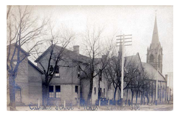
St. Peter School, late 1890s

The Chicago Architect Henry Schlacks built the present church, which stands at the apex of the angle formed by Lincoln Ave. and Niles Center Rd., in 1894 at a cost of $33,000. The church built in Gothic Revival Style incorporates pointed arches and tall columns in both its interior and exterior. Eight gigantic trees serve as supports for the high vaulted roof, however from the inside they appear as pillars on each side of the church. Brick from Milwaukee was used to build the structure.