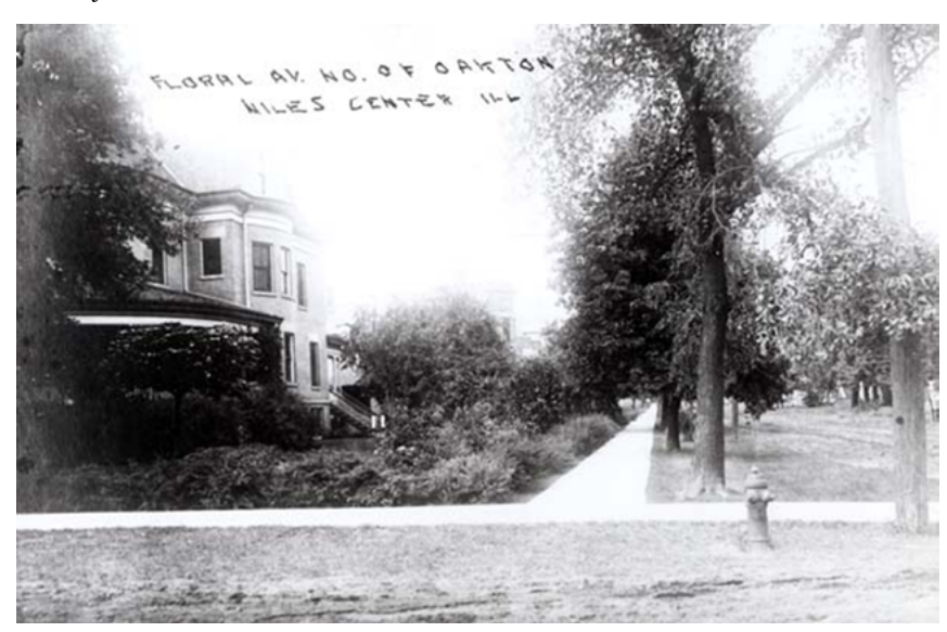
Looking north up Floral Ave. from Oakton St., c. 1900s

The Kindt House: 8024 Floral Ave. This house across from the Skokie Heritage Museum was built in 1877. It belonged to Charles Kindt, one of early Niles Centre's mailmen. Its original shingles and ironwork have been covered and removed, and a larger porch has been put in. However, some older elements are still visible such as the stone base of the house.