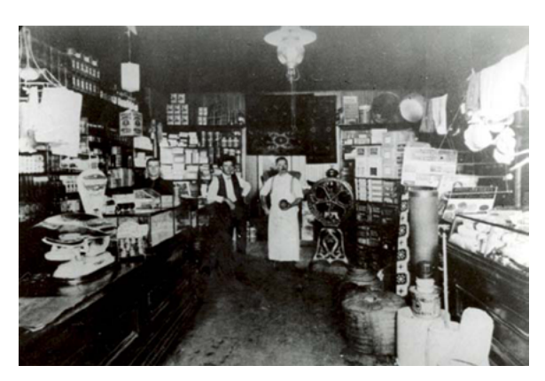
Interior of Schoeneberger Brothers General Store, c. 1910

At the center of the cemetery is the priests' plot where former pastors are buried, while in the northeast corner of the cemetery lies the "Profane Corner," an area set aside for the burial of suicides.