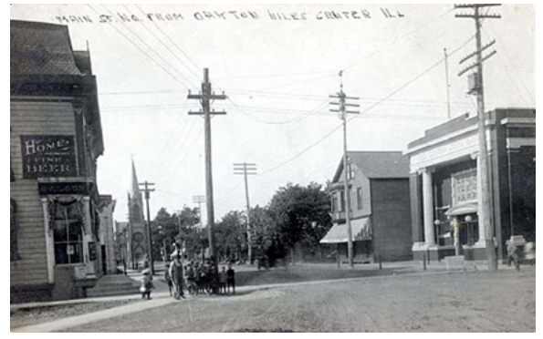
Looking north on Lincoln Ave. from Oakton St.

Lincoln Ave. and Oakton St. When Skokie (originally named Niles Centre) was incorporated in 1888, it was about one square mile in area and lay in the middle of Niles Township. Standing at the corner of Lincoln Ave., originally called Main St., and Oakton St., originally Harms Rd., one can see three of Niles Centre's original boundaries: Skokie Blvd. to the east, Long Ave. to the west, and Mulford Ave. to the south. Today's Main St. was the northern boundary except for a small area to the northwest that included two cemeteries and farms.