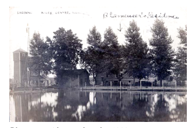
Blameuser residence and pond, c. 1900.