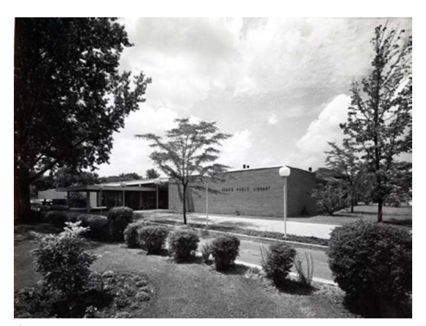
Skokie Public Library, c. 1960

Skokie Public Library: 5215 Oakton St. The library began on February 8, 1930 as a project of the Cosmos Club, later the Civic Women's Club of Skokie. Staffed with volunteers, the library was located in a rented space at 5102 Oakton St. Because of a lack of funds, the library closed in 1932. After receiving a book donation in 1933, the library reopened in the Village Hall. It remained in the Village Hall until 1942, when it became a tax-supported institution and moved into a shared space with the Post Office at 4913 Oakton St. After the Post Office moved in 1952, the library took over the entire space.